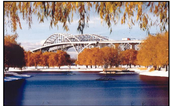
The coating on this bridge, the Scenic Blue Water Bridge, contains raybo 85 Rustib.

Raybo 85 Rustib is primarily designed for use in solvent based catalyzed systems, such as epoxies and urethanes, and is well suited for use in primers, direct-to-metal one coats, and high gloss applications. Raybo 85 Rustib is commonly used in high performance corrosion resistant coatings, such as coatings for bridges and oil well platforms.