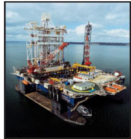
The coating on this oil well platform contains raybo 85 Rustib.